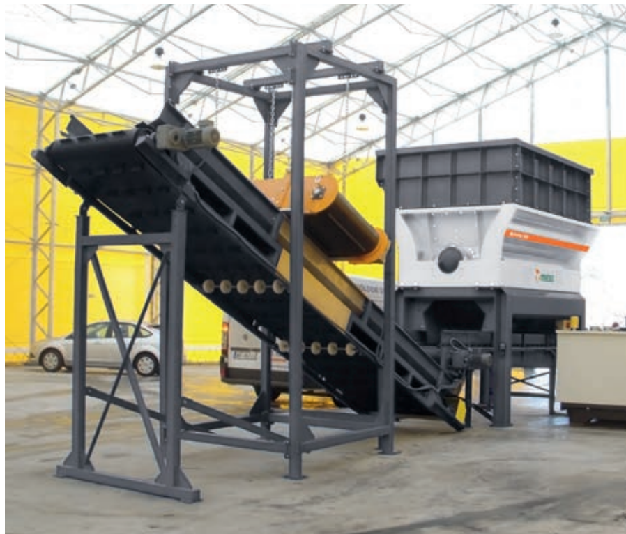
M&J PreShred 2000S

Metso shredder equipment is often used for processing waste. As waste flows can be heterogeneous with unpredictable and varying characteristics, there is heavy demand on stationary pre and fine shredding equipment. With their well-proven ruggedness, versatility and reliability, Metso systems are the equipment of choice for waste processing installations globally, and well qualified for input material such as, Bulky, Industrial (C&I), Household (MSW), Wood, Construction and Demolition (C&D)