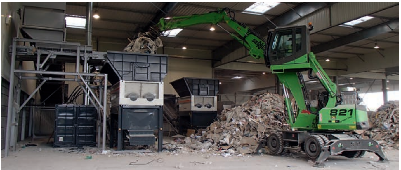
M&J PreShred 4000S

The M&J PreShred 6000 is one of the largest pre-shredders on the market, and is capable of shredding large volumes of any kind of waste. The unit is ideal when there is a need for very high capacities or for shredding material that is either extremely bulky or very heavy.