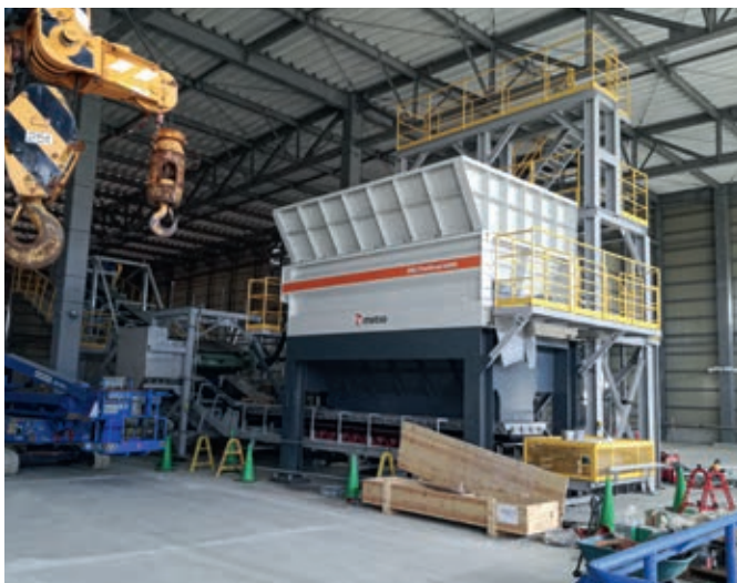
M&J PreShred 6000S